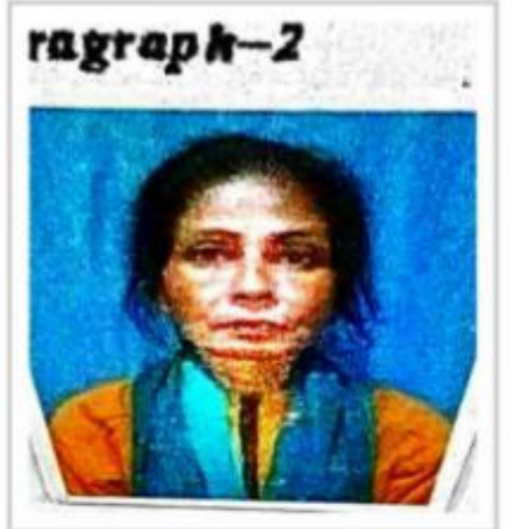
Photo of HOF

Card Type : PHH Ration Card No. : [REDACTED] Head of the Family : [REDACTED] Member ID of HOF : [REDACTED] Age of HOF : 53 Gender of HOF : F Address : [REDACTED] Total Family Members : 2 FPS Code & Address : [REDACTED]