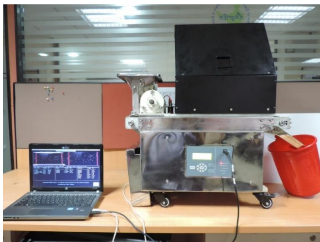
Fig. GrainEx System.