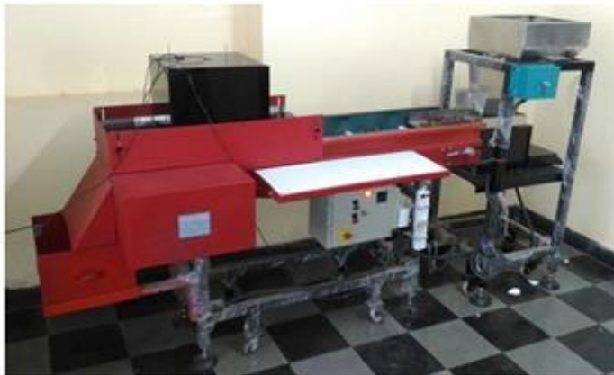
ConveyORIZED Chilli Quality Assaying Machine

An AI and Image Processing based Quality Assaying Solution for Appearance based Quality Attributes