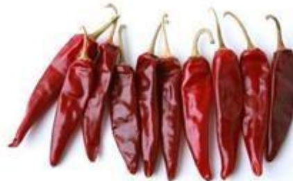
Different types of dry red chillies