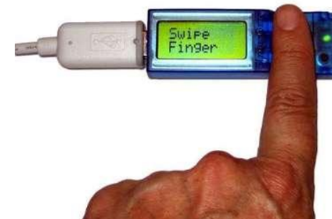
Finger Print Biometric