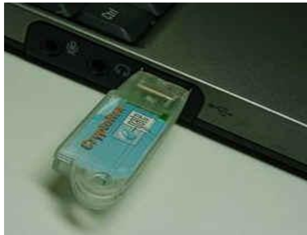
Crypto Token containing DSC